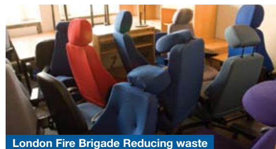
London Fire Brigade Reducing waste